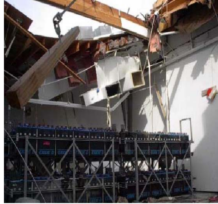
Photo of a battery room that exploded, resulting in massive property damage. Case study featured next page

It is common practice to have UPS backed by battery in the modern technology world. However, the ventilation issues are not adequately understood and addressed while designing UPS room. This note highlights few issues concerning explosion risks in battery rooms and design features that need to be incorporated during construction phase.